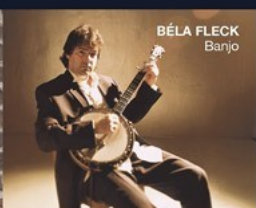
BÉLA FLECK Banjo