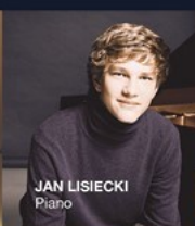
JAN LISIECKI Piano