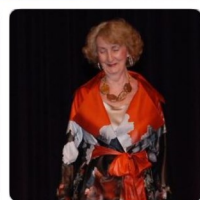
Fall Fundraiser Style Show