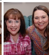
New Member Orientation

Do you want to know more about what's going on in WSL?